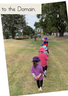
Walking to the Domain.

We will also practise walking with a partner and holding their hand while staying together in line and crossing the road safely.